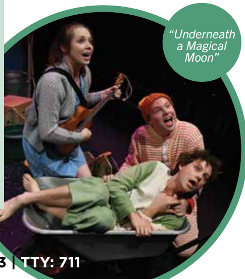
"Underneath a Magical Moon"

Through her open window, Wendy Darling normally gazes out at the night sky dreaming of blue lagoons, magical moons and the imagined stories she can tell. But tonight, like no other, has magic in the air... "Underneath a Magical Moon" is set in the backyard where Wendy and her brothers are camping out. There's a full moon and Wendy just can't get to sleep, so she begins to tell her brothers a story. Join us for this enchanting, reimagined story of "Peter Pan" told by Wendy, as we fly into a fantastical world of adventure, where the impossible seems possible and if you close your eyes and believe, you really can make anything happen.