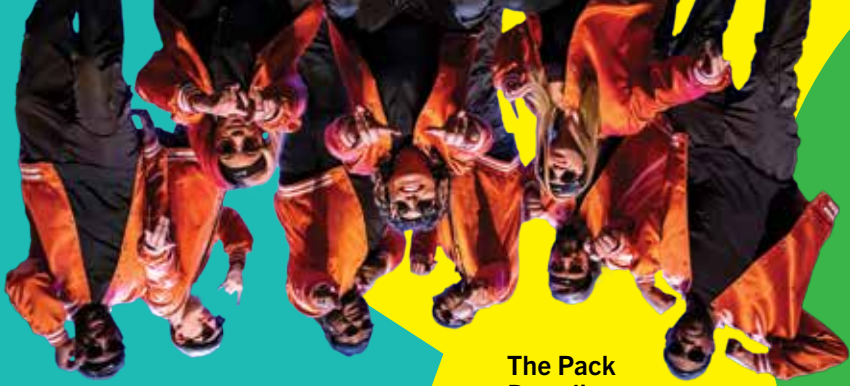
The Pack Drumline