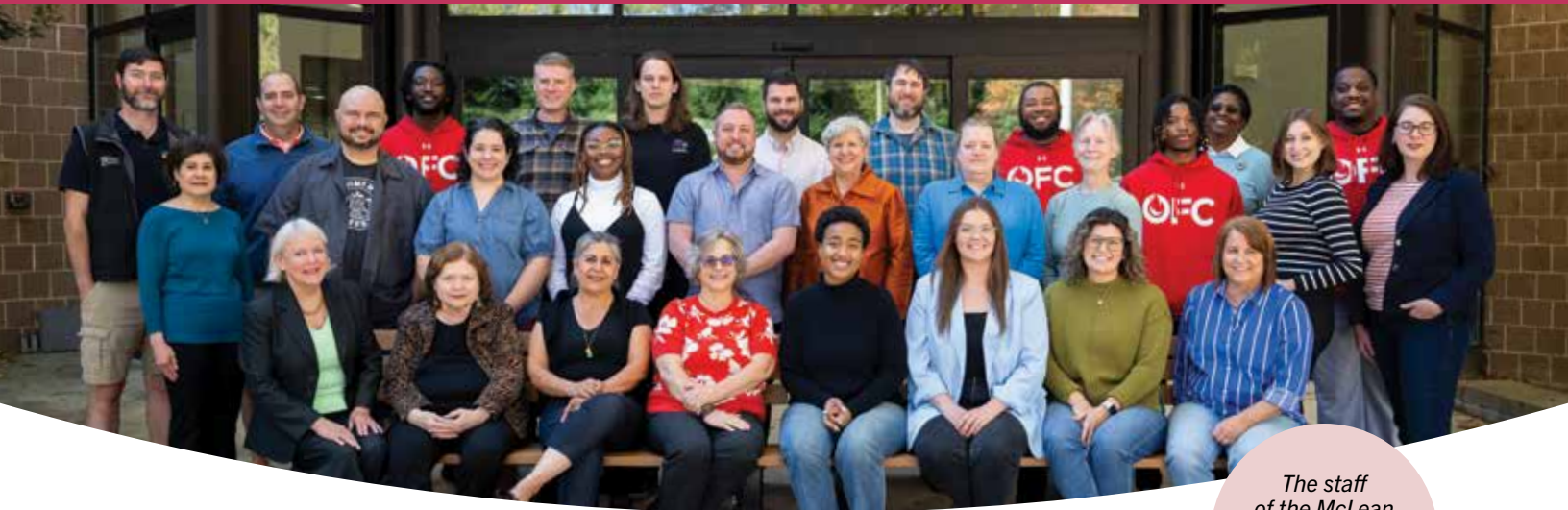
The staff of the McLean Community Center, photographed in October 2024