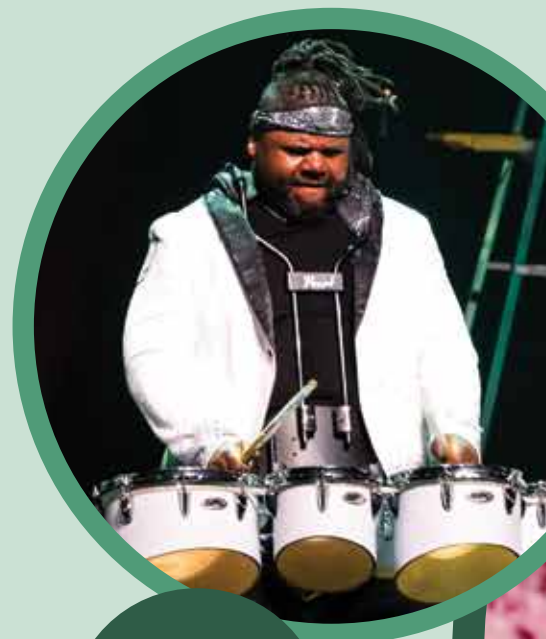
From left to right: The Pack Drumline; LOVER: An Eras Tour Experience; Good Co.

As always, every summer show is free! New, accessible parking is located a short distance from the venue. In case of inclement weather, a notice of cancellation will be posted at mcleancenter.org and on all of our social media platforms at least an hour prior to showtime.